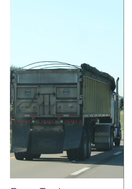
Dump Trucks Dump Trailers